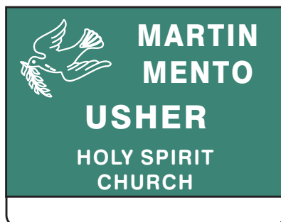
Style S2 Slip-On