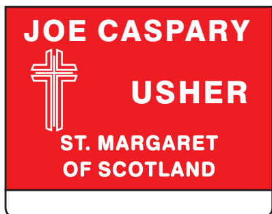
Style S1 Slip-On