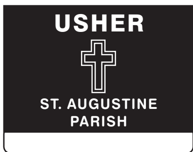
Style S3 Slip-On